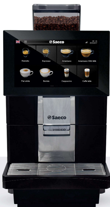
SAECO SE 120

Connection tube set G3/4" change into G3/8" length 1.5M metal tube