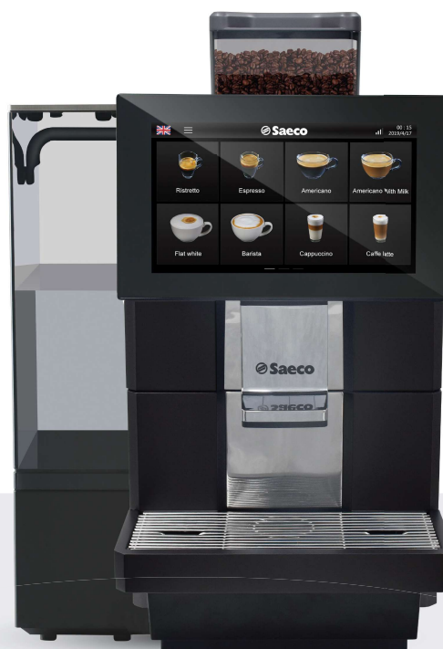
SAECO SE 180